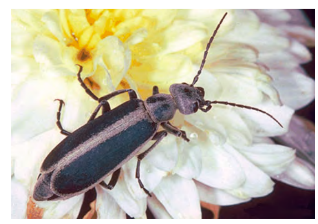
Figure 3. Margined blister beetle.