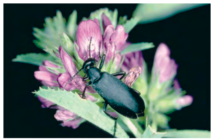
Figure 2. Black blister beetle.

colic, diarrhea, blood in stool and urine, and the sloughing of intestinal linings have been associated with the ingestion of contaminated hay. Poisoned horses may pass small amounts of blood-tinged urine, place their muzzle in water without drinking, or suffer from elevated temperature, increased pulse rate, dehydration, depression and shock. Death or, in the case of pregnant mares, abortion can result within 24 hours of consumption of contaminated hay. If blister beetle poisoning is suspected, CONTACT A VETERINARIAN IMMEDIATELY.