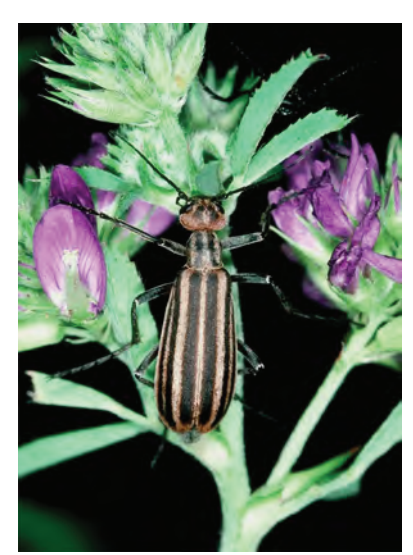
Figure 1. Striped blister beetle.

Blister beetles contain a chemical toxin in their bodies called cantharidin . Cantharidin causes irritation that can blister skin and internal body surfaces. Horses are sensitive to this compound, but ruminate livestock such as cattle and sheep also can be affected. In horses,